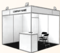
Exhibit Space Cost