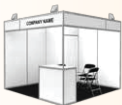
Exhibit Space Cost

• Shell Space Rate: USD $ 400 / sqm (Minimum booth: 9 sqm)